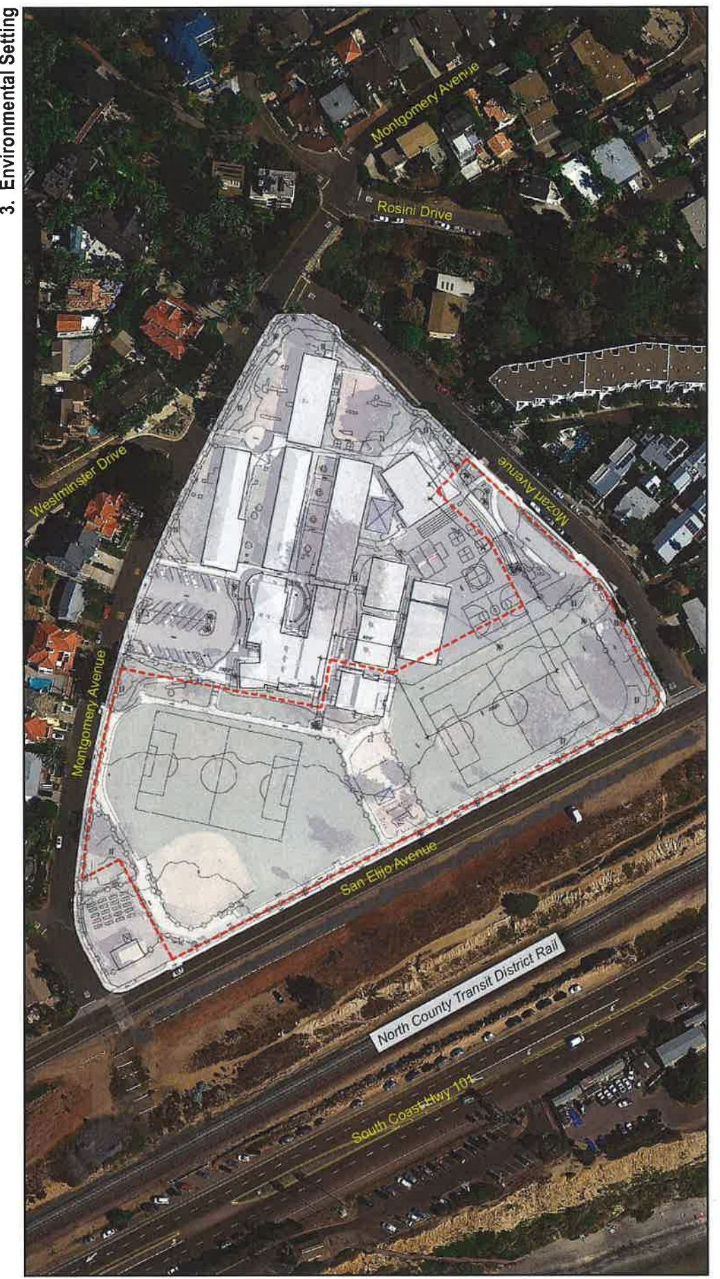
Figure 3-7 - Existing 6(f)(3) Boundary Map 3. Environmental Setting